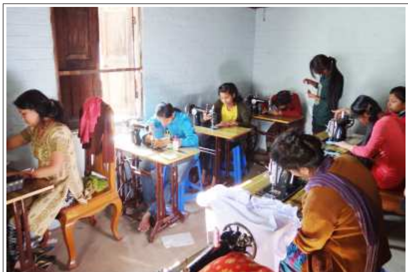
Trainees Receiving training at the Centre

CDAC have been conducting 12 months Tailoring & Cutting training for Other Backward Classes (OBCs) women and youths since last many years. The main objective of the programme is to impart skill development training to girls, women and youths belonging to other backward classes (OBCs) so that they can take