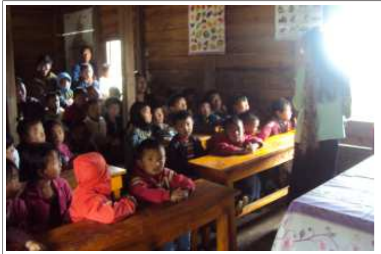
Children at a Special School

CDAC has set up two Special Schools for Child Labours one each at Moreh and Salemthar villages of Chandel District with the financial support from the Ministry of Labour & Employment, Government of India, New Delhi. The School admitted 50 (fifty) child labours each and provided non-formal education by its instructors. Most of these children are drawn from various shops, garages, restaurants, tea-stalls, and children engaging in agricultural activities in the villages with a special arrangement with their