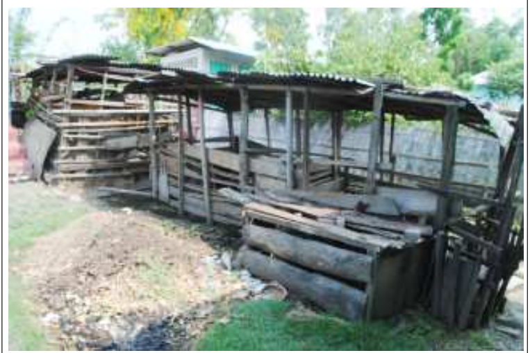
A view of Piggery unit

two villages and also supported 50% of feeds and concentrates. Each beneficiaries shall returned 5 piglets to the organisation after breeding or 2 matured pigs. The returned piglets are again distributed to new beneficiaries. Thus, the programme has been helping many poor women in their income generation and socio-economic upliftment and it has also been the important income earning unit of organisation's revenue since its inception. The farm has also been serving as training centre for piggery farming for the beginners.