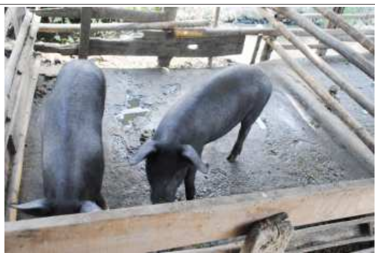
Pigs at the Piggery farm

CDAC has been engaging in piggery farming since the year 1998 to encourage self-employment among rural and tribal women through livestock farming in rural and tribal areas of Thoubal and Chandel District thereby increasing of meat products and improving income of poor rural and tribal women. In view of the increasing demand of pork meat products and coverage of women beneficiaries, CDAC from this year expanded programme. During this year the organisation identified 100 poor women from Tengnoupal and Moreh villages in Chandel District for the programme. The identified women were given training on piggery farming by experts from District Veterinary office and successful farmers at Tengnoupal and Moreh Village. Piglets were distributed to identified and trained women beneficiaries in phase manner. The Organisation supplied 5 (five) piglets each to women beneficiaries of the