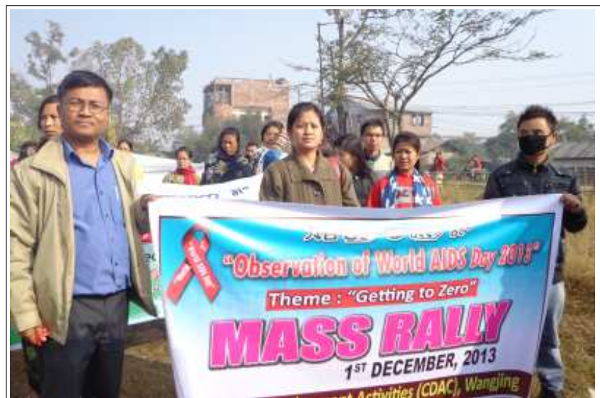
Participating the observance of World AIDS Day, 2013.

CDAC has been engaging in prevention of HIV/AIDS amongst youths and women since last 10 years by creating awareness on HIV/AIDS among rural masses. In recognition of its efforts, the Manipur State AIDS Control Society (MSACS), Imphal has provided financial assistance to implement a project on Targetted Intervention (TI) amongst Injecting Drug Users (IDUs) at Sinakethei, Ukhrul District, Manipur from December, 2013. The Main