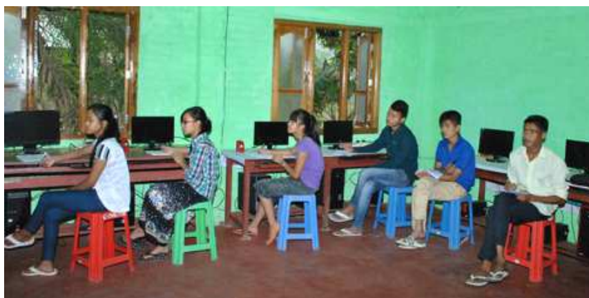
Trainees receiving computer training

The Institute has also been conducting various courses on Computer for various level of trainees. The main objective of the training is to impart skill training of computer to educated unemployed rural youths so that they may be in a position to get a job or self-employed. The aim of skill development, is not merely to prepare them for jobs, but also to improve the