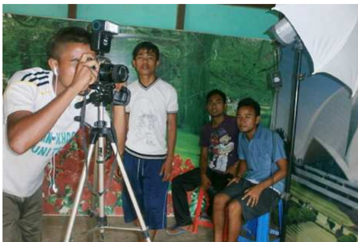
Trainees receiving photography training

The Institute has been conducting 1 year's vocational training on still photography. The main objective of the training is to impart skill training of photography to unemployed rural youths of OBC community so that they may be in a position to get a job or self-employed. The trainees have been imparting techniques of photography like indoor & outdoor photography, digital photography, dark-room techniques and computer applications by the experienced Instructors. They are also provided training materials like films, foto papers, chemicals etc. and monthly stipend.