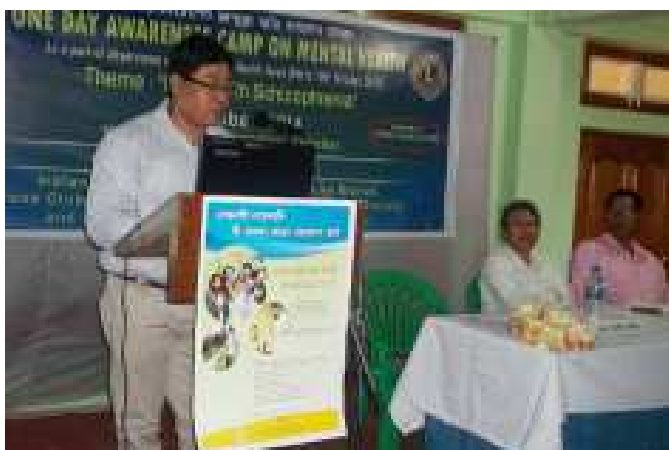
A Resource Person speaking at Awareness Program on Mental Health

and cane & bamboo craft also imparted to the beneficiaries as part of rehabilitation.