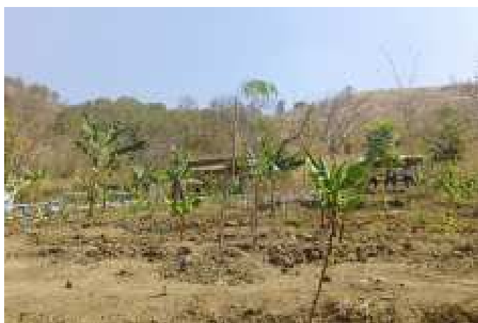
Tree planted as part of the Campaign