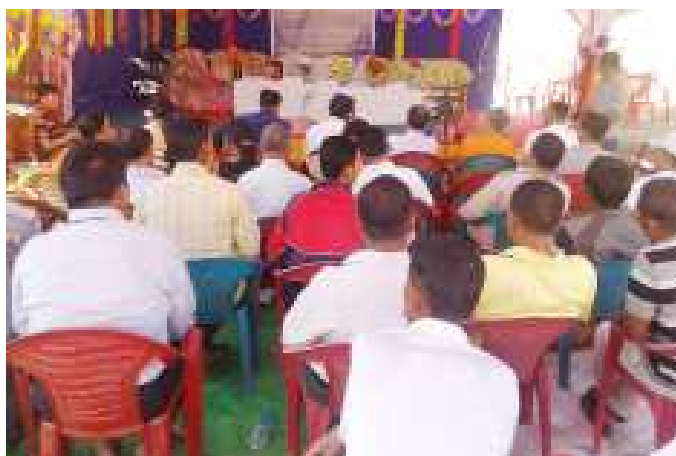
A view of the camp

CDAC Manipur as part of its labour welfare programmes conducted various welfare programmes for marginal women and women labours of different villages of Thoubal CD block and Moreh Block of Chandel District to improve their income, health condition and awareness on their rights as a labourer. It organises 14 awareness generation camps for women labours engaging in agricultural farming, quarry works, construction works, brick field works etc. which includes the topics on health, nutrition, sanitation, provisions in legislations on minimum wages, working conditions/hour, compensation, welfare provisions etc., income generation activities etc.