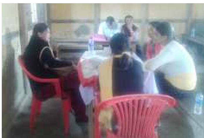
An inmate is being examine by Doctor

CDAC Manipur has been engaging in prevention of HIV/AIDS amongst youths and women since last 10 years by creating awareness on HIV/AIDS among rural masses. In recognition of its efforts, the Manipur State AIDS Control Society (MSACS), Imphal has provided financial assistance to implement a project on Targetted Intervention (TI) amongst Injecting Drug Users (IDUs) at Sinakethei, Ukhrul District, Manipur from