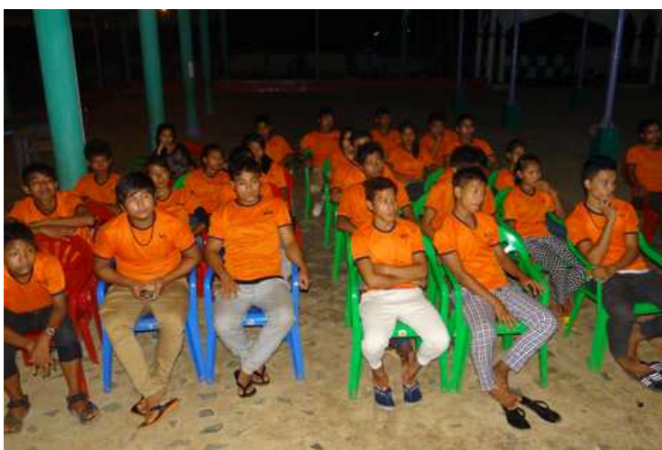
Youths attending the camp

CDAC Manipur as part of its health & control of HIV/AIDS transmission among youths conducted a one day awareness camp at Moreh, Chandel District in connection with World AIDS Day, 2014 on the theme "Focus, Partner, Achieve-An AIDS Free Generation. During the camp doctors from Moreh Hospital and resource persons from NGOs working in HIV/AIDS in Moreh town spoke on various issues. The camp was participated by about 50 boys and girls of the town.