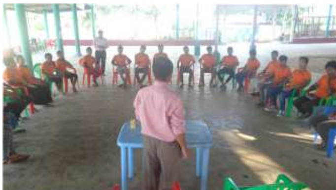
Meeting of Balala Sangha in progress

CDAC Manipur has set-up Epamlamdram Protective & Rehabilitative Home at Moreh under the scheme to provide shelter and rehabilitation to the survivors of human trafficking. The Home provides shelter to 50 survivors of trafficking. Most of them are rescued by the organisation and some are referred by the Police, CVG, CWC, Childline or other civil society organisations for rehabilitation and further re-integration to families or repatriation to their country of origin or state. Social Workers and Clinical Psychologist of the Home help them in