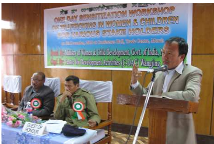
A Resource Person speaking at the Workshop on Human Trafficking

CDAC Manipur has implemented all 5 (five) components of the scheme - Prevention, Rescue, Rehabilitation, Re-integration and Repatriation.