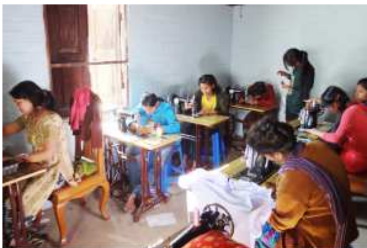
Trainees receiving training at the Centre

CDAC Manipur has been conducting 12 months Tailoring & Cutting training for Other Backward Classes (OBCs) women and youths since last many years. The main objective of the programme is to impart skill development training to girls, women and youths belonging to other backward classes (OBCs) so that they can take up the trade for self-employment and for employment after the training for their livelihood. During the year the programme benefitted 30 girls, women and youths from Moreh areas of Chandel District. They were