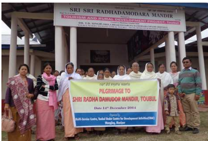
Older Persons at Pilgrimage