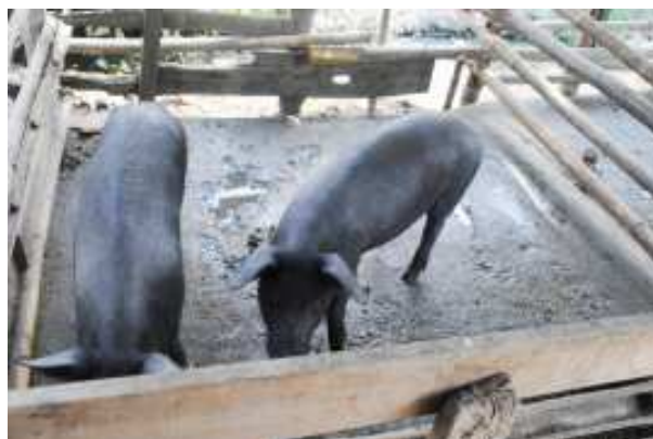
Piglets at the farm

CDAC Manipur has been engaging in piggery farming since the year 1998 to encourage self-employment among rural and tribal women through livestock farming in rural and tribal areas of Thoubal and Chandel District thereby increasing of meat products and improving income of poor rural and tribal women. During this year the organisation identified 100 poor women from Tengnoupal and Moreh villages in Chandel District for the programme. The identified women were given training on piggery farming by experts from District