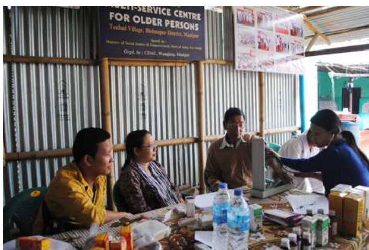
Health Check-up at the Centre

consumption for its low price and good quality. Thus an older person can earned extra income at the centre while spending time with their peers.