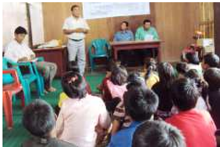
Children attending a class by Resource Person at Salemthar Centre

CDAC Manipur has been running two Special Schools for Child Labours one each at Moreh and Salemthar villages of Chandel District with the financial support from the Ministry of Labour & Employment, Government of India, New Delhi since April, 2013. The School has admitted 50 (fifty) child labours each and provided non-formal education by its Educational instructors and vocational trainings on paper bag making, light cane & bamboo craft, agarbati making etc. by the Vocational Instructors. Most of these children are drawn from various shops, garrages, restaurants, tea-stalls, and children engaging in agricultural activities in the villages with a special arrangement with their employers and parents/guardians. At the School children are provided nutritional foods and regular medical check-up. After giving non-formal education at the schools arrangement are also made to admitted to formal education to continue education.