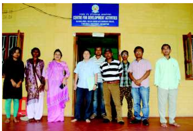
Receiving of a victim (2nd from left) from CWC, Thoubal

CDAC Manipur has been running a Multi-Service Centre Older Persons at Toubul Village, Bishnupur, Manipur since February, 2002 with the generous support from the Ministry of Social Justice & Empowerment, Govt. of India, New Delhi under their Integrated Programmes for Older Persons . The project benefitted 50 poor and uncared for older persons. These older persons gathered at the centre every day and spent the day by chatting, reading books, news-papers, journals, listening of sat-sanga, kathas on Ramayana, Mahabharata, Meitei puya, bashak, Khongjom parva, watching of TV, health talks etc. along with their peer groups.