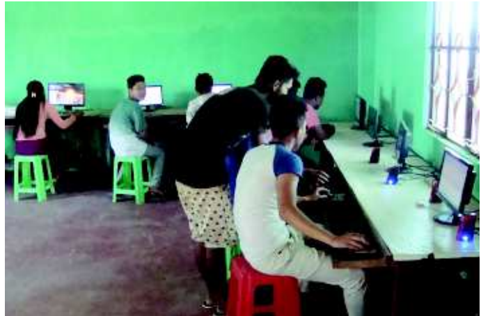
Trainees receiving Computer Training

The Institute has so far trained about 480 youths under the scheme since its inception in 2000. Counselling on jobs and self-employment to the passed-out trainees are also given and many of them have got jobs in photo studios, colour photo printing labs, film industry and many of them are self-employed. *