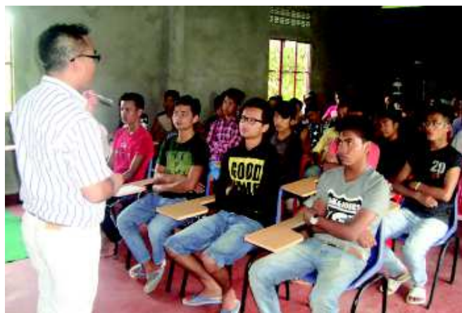
Youths listening to a Resource Person

CDAC Manipur has organised 3 (three) days Leadership Camp for Youth & Adolescents at Salungpham Village, Thoubal District. The main objectives of the camp are - to develop leadership qualities and personality development of youth and to channelize their energy towards socio-economic development and growth of the nation. The Camp was attended by 25 boys and 25 girls from the village. During the camp, they were given training in confidence building, self-reliant learning and problem solving, personal hygiene, reproductive health and fertility related issues like STDs, HIV/AIDS to strengthen their literacy skills by resource persons including Clinical Psychologists/Counsellors, Career/Vocational Counsellors, Physicians, teachers etc. Career guidance was also given on various vocations so that they can choose a suitable and right trade for their future livelihood *