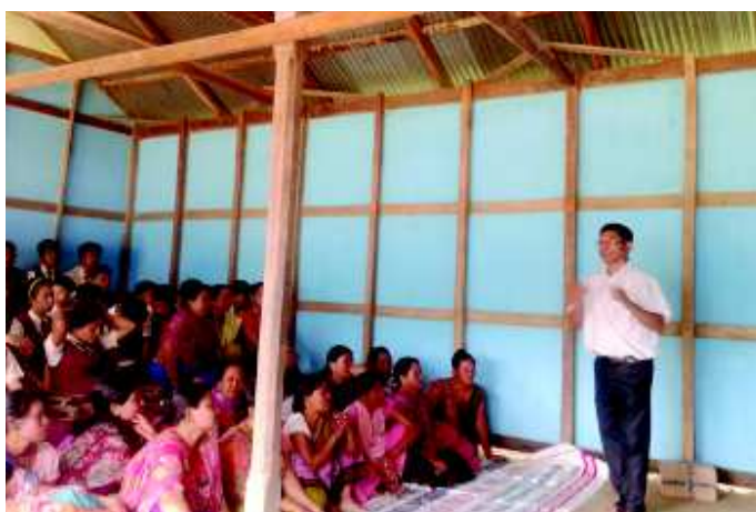
Participants listening to a Resource Person

CDAC Manipur as part of its labour welfare programmes conducted various welfare programmes for marginal women and women labours of different villages of Thoubal CD block and Moreh Block of Chandel District to improve their income, health condition and awareness on their rights as a labourer. It organises 14 awareness generation camps for women labours engaging in agricultural farming, quarry works, construction works, brick field works etc. which includes the topics on health, nutrition, sanitation, provisions in legislations on minimum wages, working conditions/hour, compensation, welfare provisions etc., income generation activities etc *