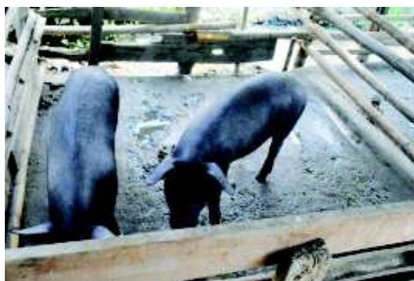
Piggery unit for income generation

CDAC Manipur has been engaging in piggery farming since the year 1998 to encourage self-employment among rural and tribal women through livestock farming in rural and tribal areas of Thoubal and Chandel District thereby increasing of meat products and improving income of poor rural and tribal women. During this year the organisation identified 100 poor women from Tengnoupal and Moreh villages in Chandel District for the programme. The identified women were given training on piggery farming by experts from District Veterinary office and successful farmers at Tengnoupal and Moreh Village. Piglets were distributed to identified and trained women beneficiaries in phase manner.