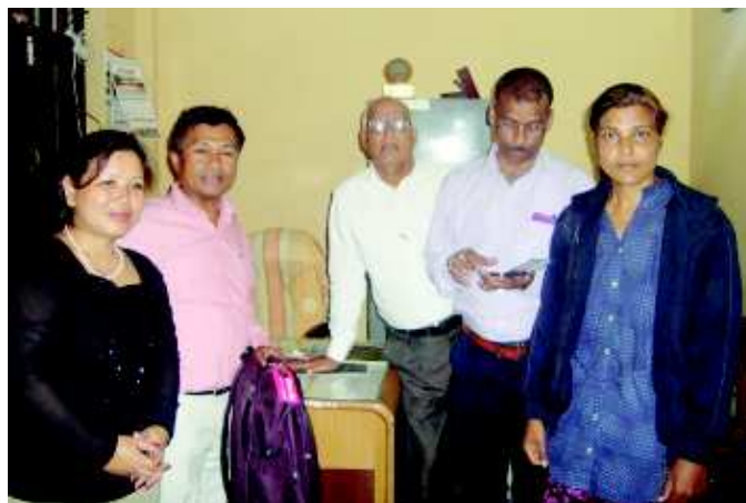
Repatriation of a Nepalese victim to Nepal (Maiti Nepal)

Routine health check-up are also done by a part-time doctor and provides medicines to the older persons. They are also taking out for site seeing, excursion, pilgrimage to different religious places, temples and religious