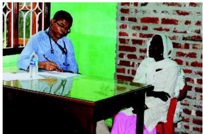
Doctor attending an inmate

CDAC Manipur has been engaging in mental health care service in community since last 10 years by creating awareness among rural masses about the mental illness and its treatment. As a continue service in the field, CDAC Manipur has started Epamlamdram Half-way Home for Psycho-social Rehabilitation of Controlled & Treated Mentally Ill Persons at Wangjing with own fund of the organisation. Initially the Home provides counselling to the controlled & treated mentally ill persons by a counsellor and a visiting psychiatrist. Vocational training on paper bag making, agarbati making, detergents/soap making, computer and cane & bamboo craft also imparted to the beneficiaries as part of rehabilitation.