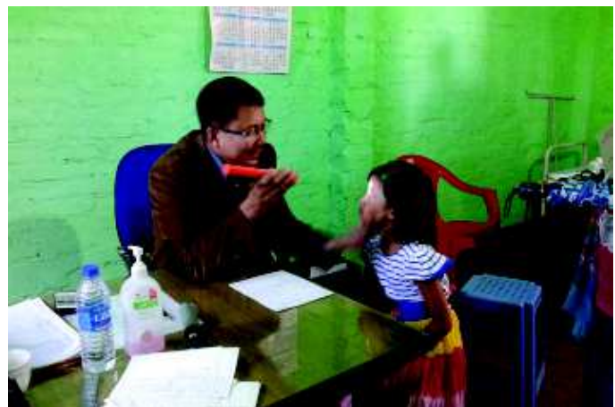
Eye Specialist examine a girl at Free Eye Camp

CDAC Manipur organises free eye screening and cataract surgery camps at Wangjing, Thoubal District on 27th October, 2015 and Toubul Village, Bishnupur District on 28th November, 2015 in collaboration with Shija Eye Care Foundation, Langol, Imphal to detect cataract and other diseases. Altogether 30 cataract cases were identified from 215 screened cases and conducted operation at Shija Hospital, Langol free cost *