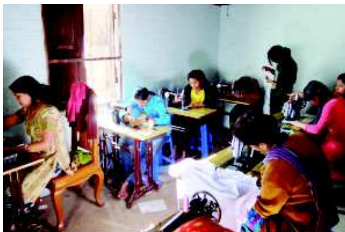
Trainees receiving training at the Centre

conducting the training since last many years with a view to impart skill upgradation training to rural poor Other Backward Classes (OBCs) women/girls & youths so as to enable them to self-employed thereby increasing their earning capacity. At the Centre, trainees were allowed to work together to earn a regular income by producing variety of embroidered and readymade items once their training is completed *