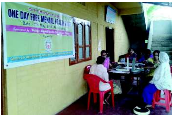
One Day Free Mental Health Camp

Health Programme, Thoubal at CDAC's Conference hall. Psychiatrist, Clinical Psychologist and Psychiatric Social Worker from DMHP, Thoubal spoke on various topics on mental health as resource persons. About 100 youths, students, women etc. attended the programme *