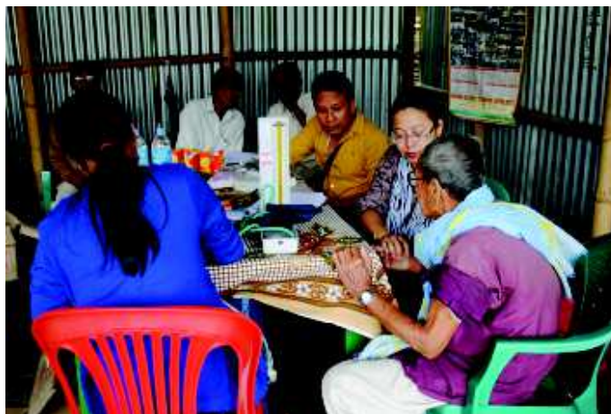
Doctor & Nurse attending an older person

CDAC Manipur has been running mobile medicare service for older persons since last one year with the aim of providing medical service to the older persons living in remote villages and hill areas of Chandel District. The programme covered 20 villages under Tengnoupal Sub-Division of Chandel District. A team of Doctor, Nurse and other volunteers visited these villages once in month and health check-up of older persons were conducted. Counselling and awareness on caring of older persons were also conducted for women, youths and community leaders from time to time. About 600 older persons were benefited by the programme *