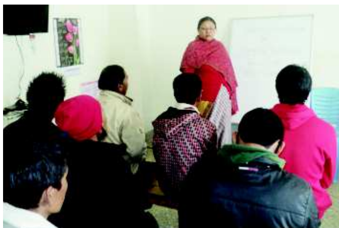
A Resource Person speaking at the Camp

CDAC Manipur as part of its health & control of HIV/AIDS transmission among youths conducted a one day awareness camp at Moreh, Chandel District in connection with World AIDS Day, 2015. The objective of the camp was to create awareness among youths about the HIV/AIDS to control the spread of the deadly virus. During the camp doctors from Moreh Hospital and resource persons from NGOs working in HIV/AIDS in Moreh town spoke on various issues. The camp was participated by about 50 youths/boys of the Moreh town *