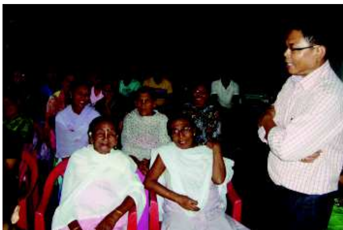
Participants listening to a Resource Persons

CDAC Manipur has been engaging in promotion of community mental programme since last 5 years with the aim of creating awareness on mental health to eliminate wrong concept about mental illness among rural masses. CDAC Manipur organised one day free mental health camp at Wangjing on 27th May, 2015 in collaboration with District Mental Health Programme, Thoubal. Two psychiatrists, 3 psychiatric nurses, two clinical psychologist, two psychiatric social workers attended 150 psychiatric patients and distributed medicines free of cost. CDAC Manipur also organised one day awareness camp on mental health on 29th August, 2015 in collaboration with District Mental